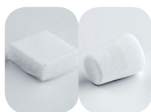
Jason® fleece / collacone®

Flexible blocks (CaP / Collagen composite)