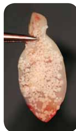
L-PRF™ matrix acts as a carrier for particulate bone material 4 . When incorporated, the graft material is suspended in the fibrin matrix and handling characteristics are dramatically improved.

The IntraSpin™ System establishes a three-step protocol for drawing and centrifuging the patient's blood, removing the fibrin clot and processing it in the Xpression™ Fabrication Kit. A thin, compressed layer of Platelet Rich Fibrin or plugs for extraction sites can then be formed, using either the internal plate or the piston assembly.